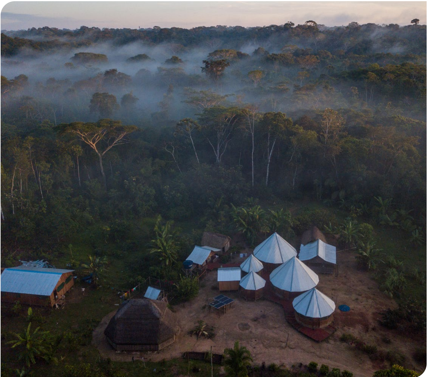
The Yawanawas are an indigenous people from Brazil and inhabit the Rio Gregório indigenous territory in Acre